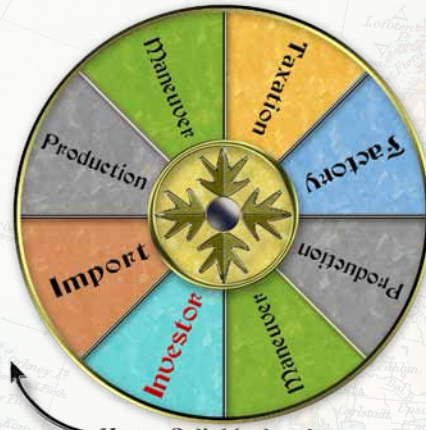
Up to 3 fields for free

The move of a nation consists of choosing a space on the rondel. In a nation's first turn, the game piece is placed on any space of the rondel. All following turns are chosen on the rondel by moving the game piece clockwise; remaining in place is not allowed. The playing piece may be moved to one of the three spaces ahead at no cost; each additional space costs the player who leads the government of that nation 2 million, paid to the bank. The maximum move on the rondel is six spaces.