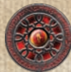
Place Influence Icon

There are three types of actions Sauron may resolve: "Place Influence," "Draw Shadow and Plot Cards," and "Command Monsters and Minions."