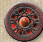
The Place Influence Icon

The "Place Influence" action provides Sauron with a number of influence tokens equal to the number on the Action Track space that he just covered. When taking this action, Sauron may immediately place up to two tokens of this influence in the Shadow Pool and the rest in extension of his Shadow Strongholds (see page 16).