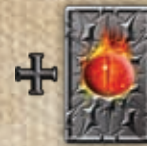
Draw Shadow and Plot Cards Icon