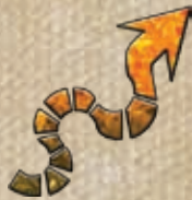
The Command Monsters and Minions Icon

The “Command Monsters and Minions” action provides Sauron with a number of commands equal to the number on the Action Track space that he just covered.