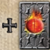
The Draw Shadow and Plot Cards Icon

The “Draw Shadow and Plot Cards” action allows Sauron to draw a number of Shadow and Plot cards each equal to the number on the Action Track space that he just covered.