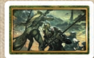
Hero Mission Card Back