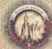
A Permanently Perilous Location

Note that Sauron may not choose a Peril card that does not affect the hero's current location or region (see next page). If none of the cards affect the hero's location or region, the three Peril cards are discarded without effect.