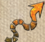
Command Monsters and Minions Icon