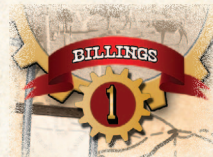
Score extra VP