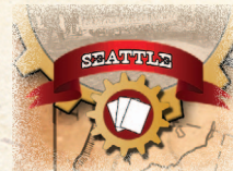
Draw 1 Power card

Collect Goods: Each building in connected Stations provides 1 Goods card or 1 VP