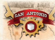
Gain 1 Bonus die

Majority Bonus: The single player with the most Trains gets city bonuses as shown here: