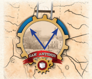
San Antonio can have 2 Buildings

Locations: Stations have either 2 or 3 building locations. The number of building locations are indicated by the blue arcs between the gear spokes bordering the Station image. A Station may not have more Buildings than the number of building locations.